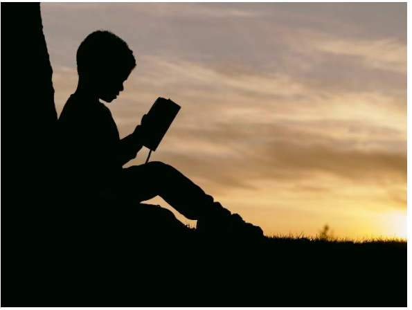
To work, wait, and watch happen in concert. They are not compartmentalized. So, in this way, you create a beautiful harmony of life as God works in you to do His will.

Watch: The lesson in Malachi 3: 6-12 is to give God our best and not hold back from Him! This requires trust. But why should you personally trust God in this way? Consider the answer for yourself, and have your group do the same.