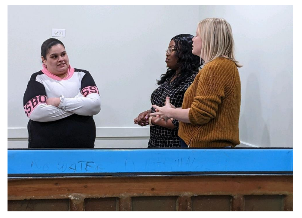
"Therefore go make disciples of all nations, baptizing them in the name of the Father and of the Son and of the Holy Spirit, and teaching them to obey everything..."