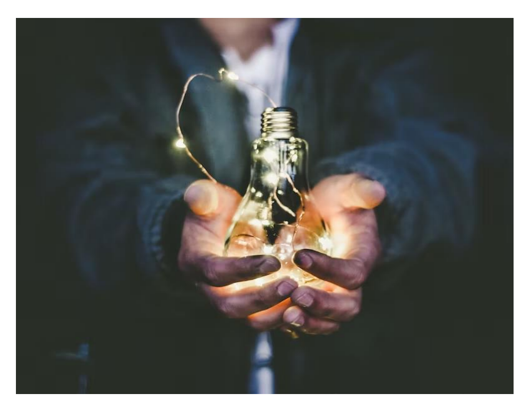
"Your measure as a leader is not only what you do, but also what others do because of what you do."

"...research shows that people are inspired to follow integrity and humility more than polished speaking or profound scriptural insights..."